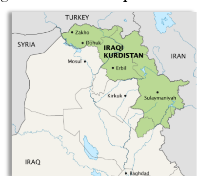
Figure 1. Federal Iraqi's Kurdistan

instability in the region. It is on under-developing stage and having potential to become the strong economy in the near future of Middle East region. Therefore, it becomes important to study the economy of the region in view of its future economy potential.